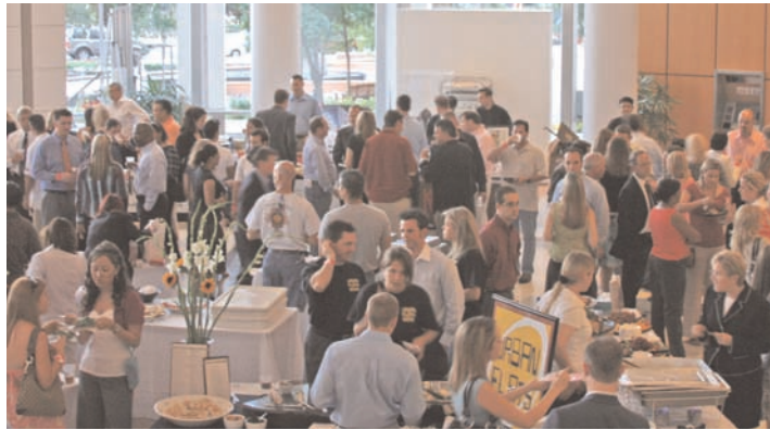
Over 300 people enjoyed delicious treats from 16 downtown restaurants at DOP's Taste of Downtown event held at City Hall in June.